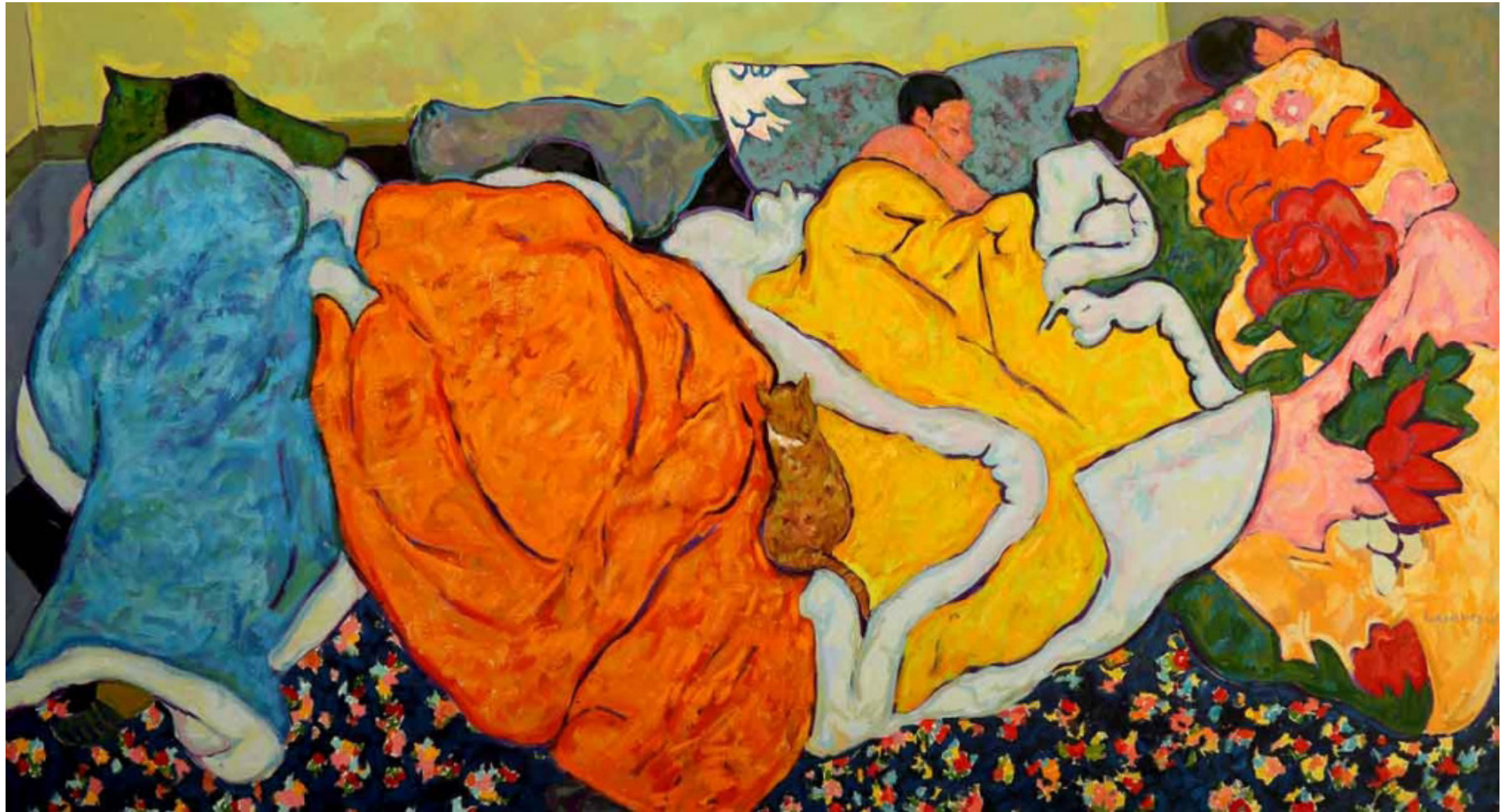
The Dream Catcher . 2018. Oil on canvas. 78.75" X 141.75"