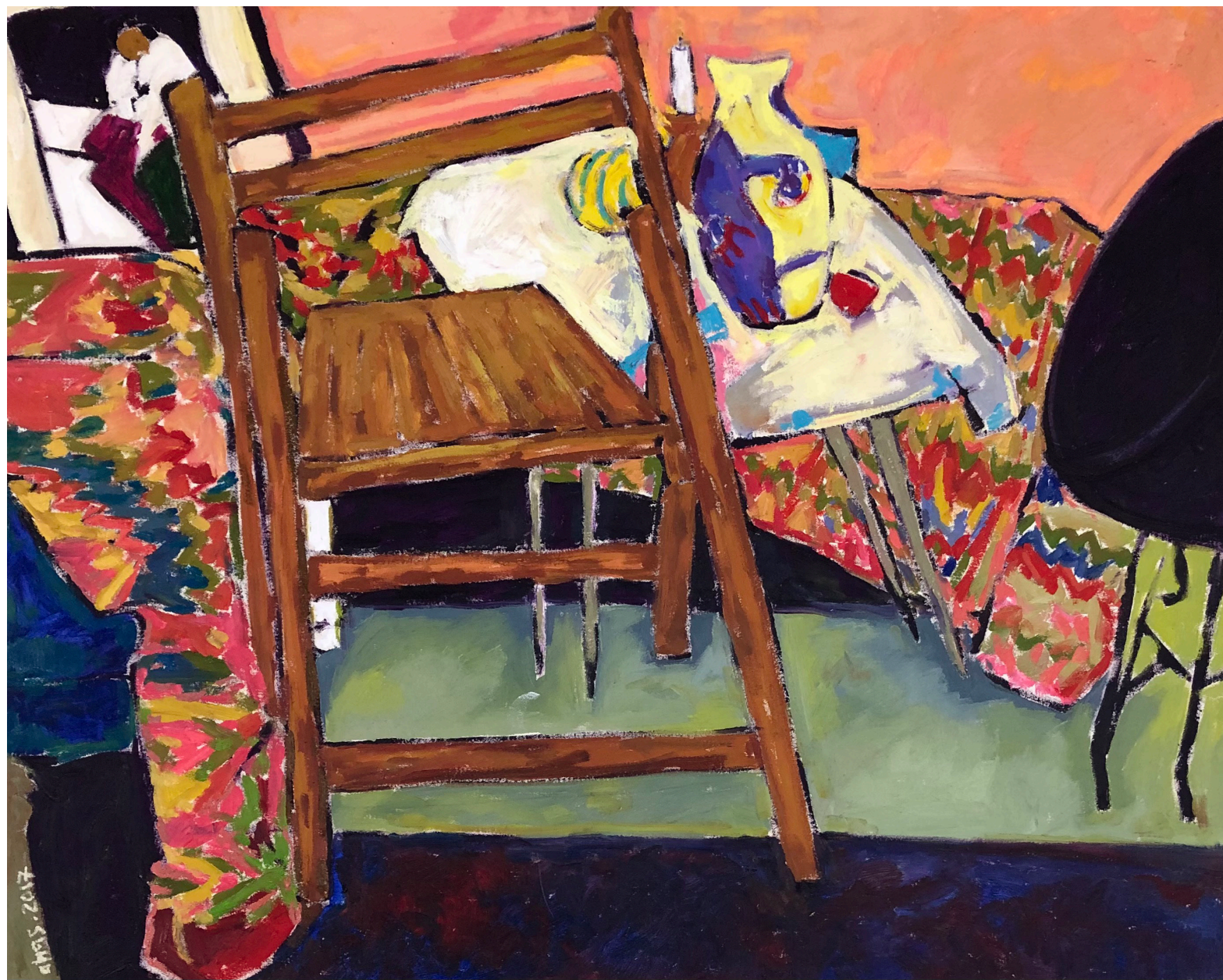
The Chair : 2017. Oil on canvas. 31.5" X 39"