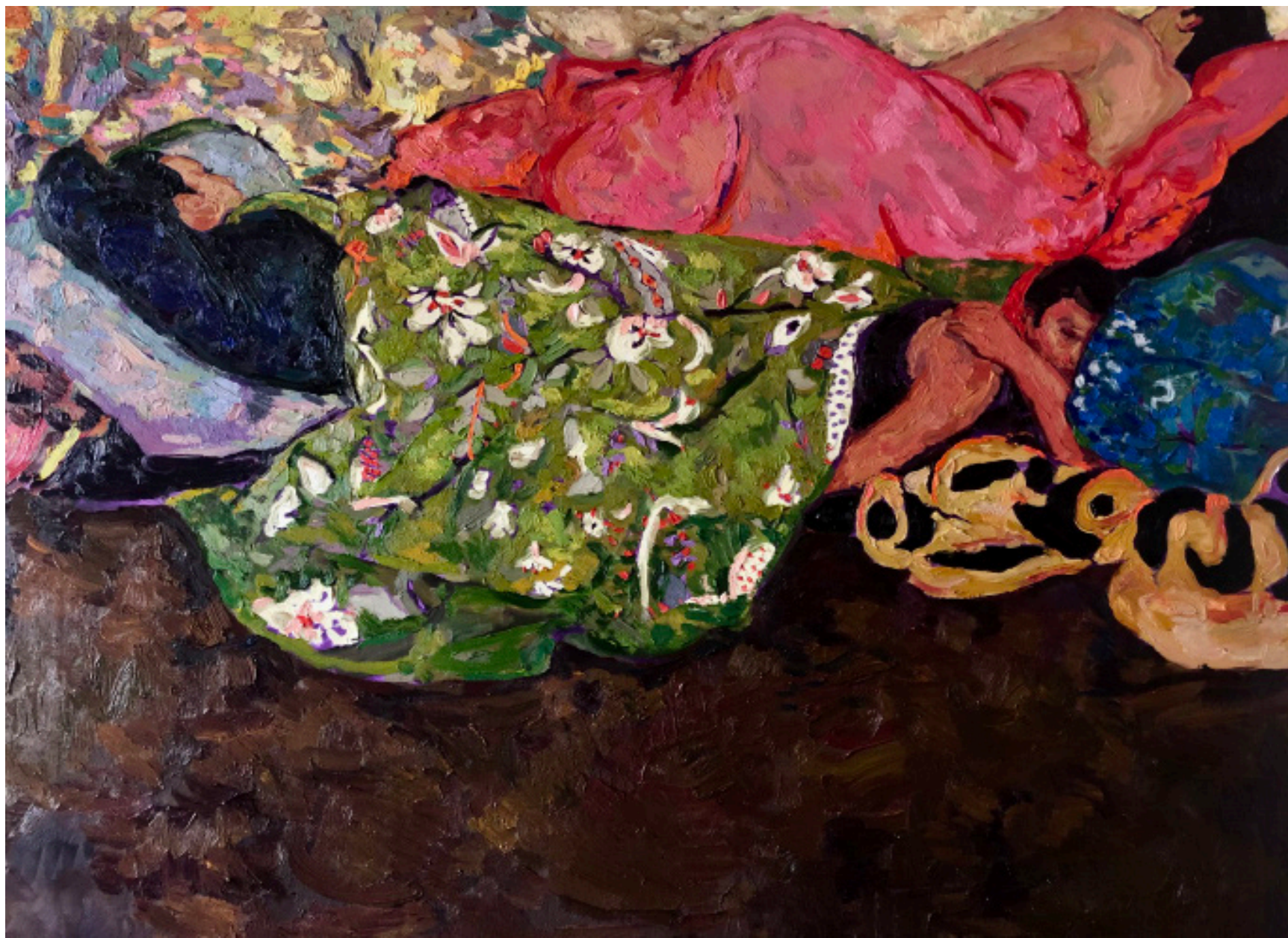
Untitled . 2021. Oil on canvas. 51" x 63.75" Opposite: Untitled . 2021. Oil on canvas. 19.75" x 15.75"