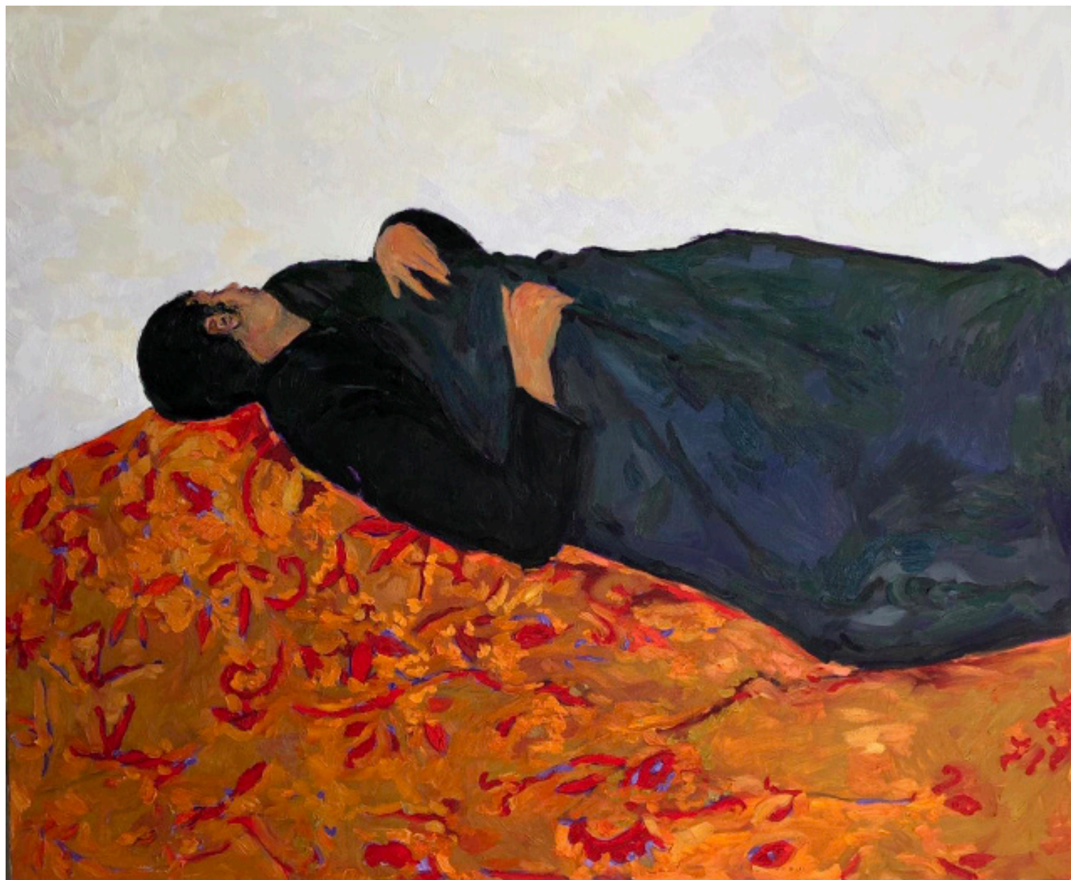
Untitled . 2020. Oil on canvas. 39.5" x 47" Opposite: Untitled . 2021. Oil on canvas. 51" x 63.75"