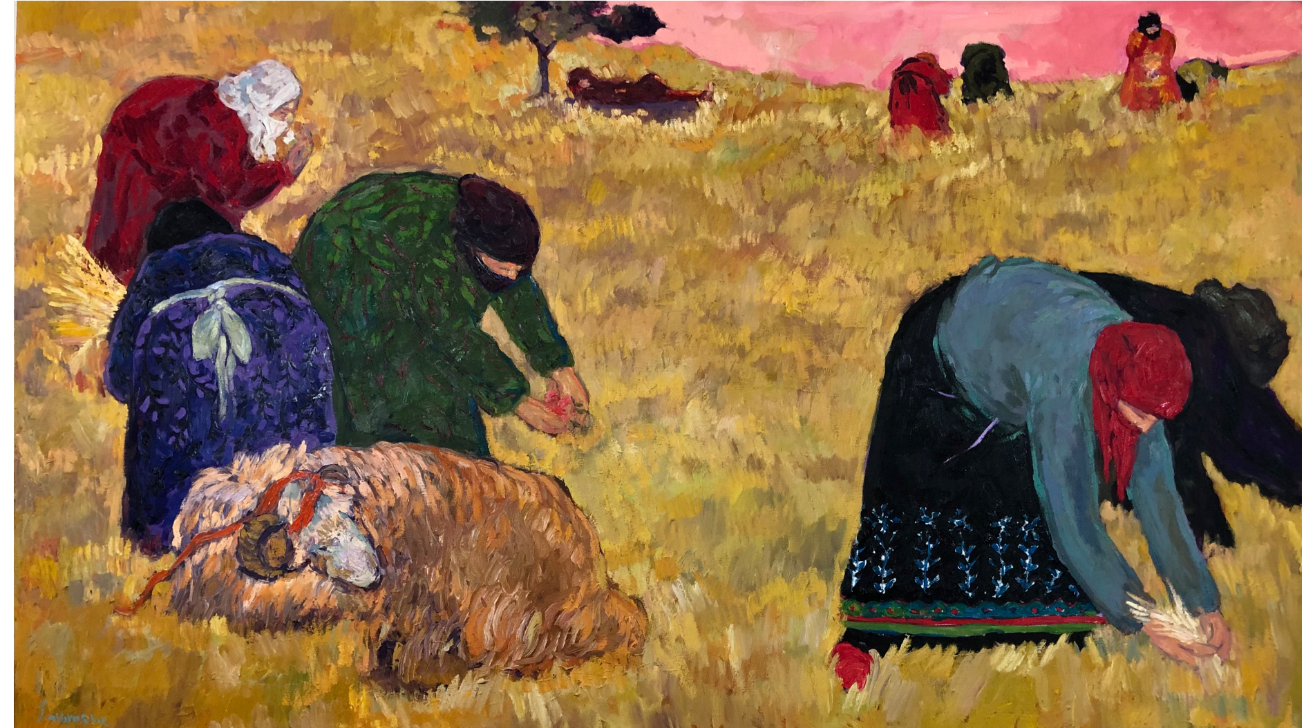
Mother Earth. 2020. Oil on canvas. 45" X 78.75"

The quilt wraps us up in our joys and sorrows and allows us to surrender ourselves and move away from life, if even for a few hours. When we are asleep we are all alike—whether you are sleeping in a palace or a child sleeping in the street, both are absent from reality, and the quilt is as intimate as your own house. In the context of my paintings, each quilt takes on a different colour to show it as a unique home to its sleeper.