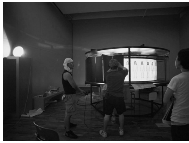
installing Becoming, Busan Biennale, 2010